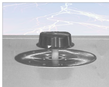
Manual operation—clockwise or anti-clockwise knob rotation to increase or lower output volts

For motorised solutions please check-out our mSA-HB-DM-CB-480 SERIES variable transformers.