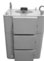
With Casing Terminal Covers