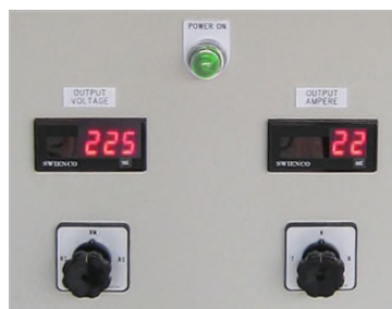
Digital Output Voltmeter & Ammeter with phase selector switches

Other voltage configurations, as well as smaller and larger ratings, available to special order.