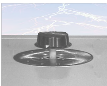
Manual operation—clockwise or anti-clockwise knob rotation to increase or lower output volts

For motorised solutions please check-out our MAE-LB-DM-CB SERIES variable transformers.