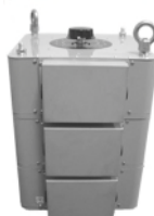
With Casing Terminal Covers